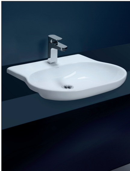
Tapware shown for photographic purposes only.