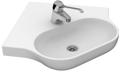
Tapware shown for photographic purposes only

The Opal Sole corner wall basin is a contemporary style basin with smooth rounded contours and clean lines. Suitable for sole occupancy units, the Opal Sole corner wall basin meets the needs of the designer market for prestige projects. With superior functionality this basin is designed with an increased projection to allow for easier access for wheelchair users. The waste is also positioned towards the back of the basin to minimise splashing. The corner basin features space saving design and is suitable for domestic, commercial and accessible applications complying to AS 1428.1-2009 Amd. 1 using standard Caroma plastic traps.*