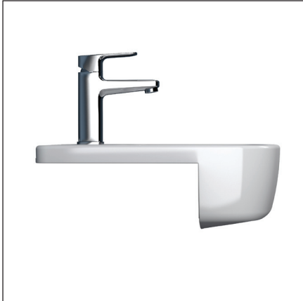
Tapware shown not included.