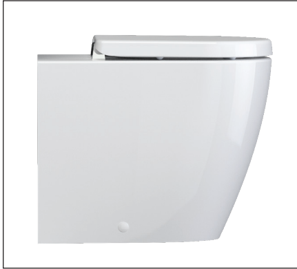
Pictured with Caroma Arc soft close seat

Combining universal design with rimless pan technology, the Urbane Cleanflush™ is a superior flushing system suitable for domestic and commercial applications. Incorporating several patented technologies: Caroma Flow Splitter™, Caroma Flow Balancer™ and Caroma Uni-Orbital® Connector, the Cleanflush pan is innovative and the next evolution in toilets. The Flow Splitter evenly flows water around the top of the bowl to meet at the Flow Balancer which directs the water powerfully into the sump, reducing the need for brush cleaning. The rimless pan is easy to clean and unlike traditional pan profiles, provides full visibility of any grime build up. Caroma Cleanflush provides a cleaner clean for peace of mind.