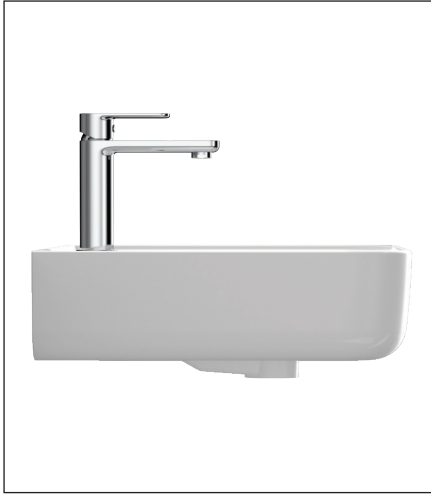
Tapware shown not included.

The Sculptural basin range represents freshness and simplicity of nordic style design. Influenced by global trends in thinner rim design, the wide variety of shapes and sizes is sure to appeal to the style conscious seeking luxury design. The basin is suitable for general purpose, domestic and commercial applications.