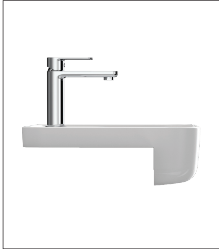
Tapware shown not included.

The Tribute basin range represents freshness and simplicity of nordic style design. Influenced by global trends in thinner rim design, the wide variety of shapes and sizes is sure to appeal to the style conscious seeking luxury design. The basin is suitable for general purpose, domestic and commercial applications.