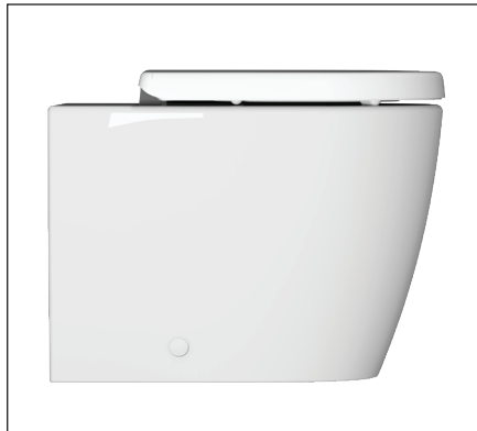
Pictured with Caroma Arc Soft Close seat

A classic designed wall faced concealed toilet suite comprises the Urbane pan and trusted Caroma Invisi II cistern suitable for use in domestic and commercial projects. The pan connection system includes the patented Caroma Uni-Orbital® Connector and adjustable flush pipe for increased installation flexibility. The Caroma Uni-Orbital® connector extends to any position in a 50mm radius, unlike traditional connectors that only move backwards and forwards. The setout range is from 60mm – 120mm with a recommended setout of 90mm. The smooth sided pan matched with the concealed cistern offer a seamless finish to your bathroom. Choose from a variety of buttons from the Caroma range to complete your desired look. The adjustable flush pipe is a new feature for the Invisi II system. If the pan inlet hole is higher than the flush pipe due to floor tiling height variations, the flush pipe can be raised by up to 25mm.